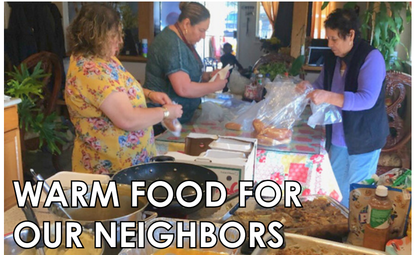
WARM FOOD FOR OUR NEIGHBORS