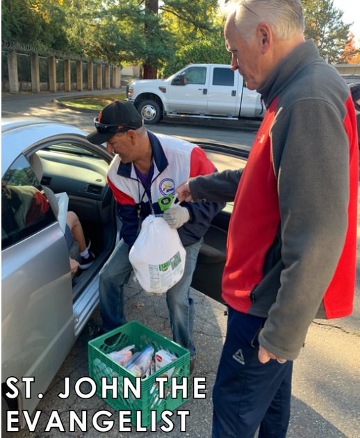
ST. JOHN THE EVANGELIST