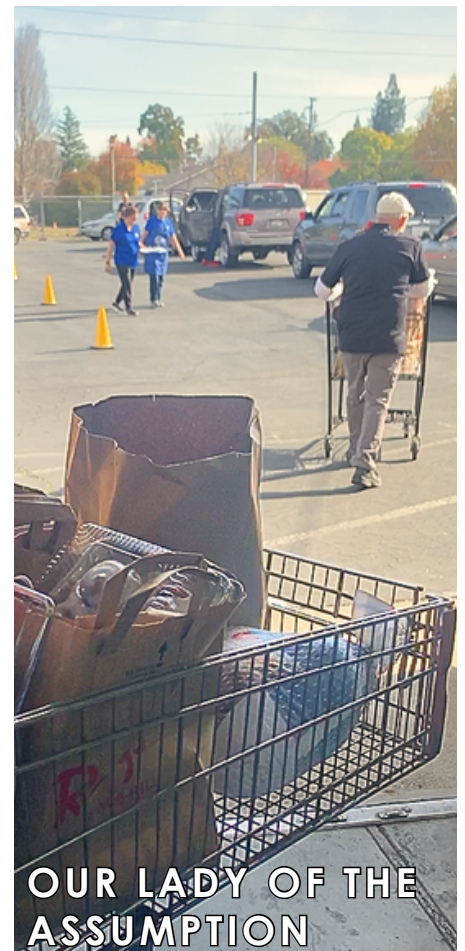
OUR LADY OF THE ASSUMPTION