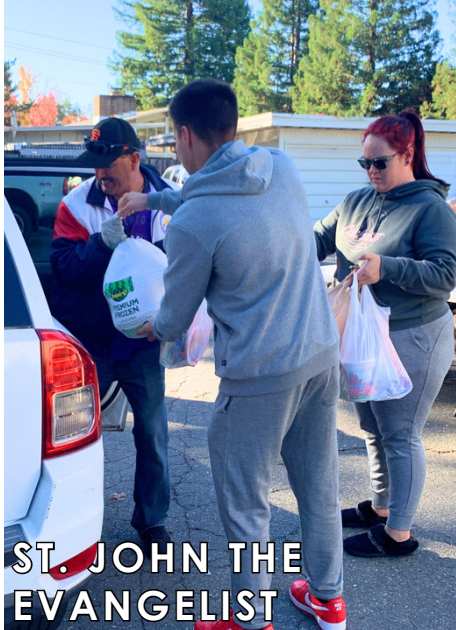
ST. JOHN THE EVANGELIST