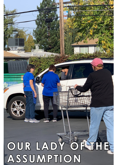
OUR LADY OF THE ASSUMPTION